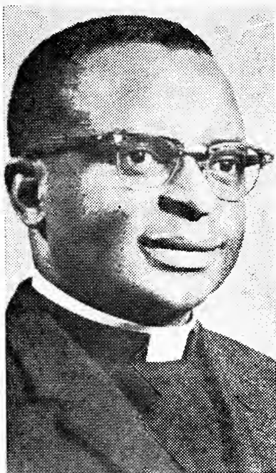
Bishop Abel Tendekayi Muzorewa